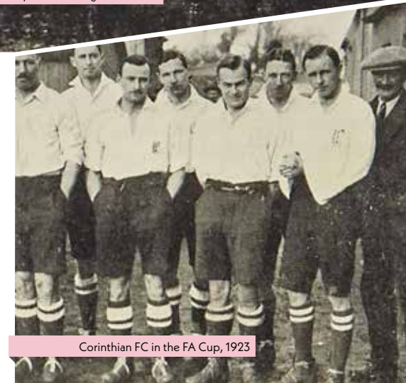
Corinthian FC in the FA Cup, 1923

Corinthians played with style and class, so much so that, when Real Madrid were founded, they decided to adopt white jerseys in their honour. Yet, the Corinthians' most obvious stamp on modern football is a legacy of their 1910 tour to Brazil, during which their performances so impressed the locals in Sao Paulo that they formed their own club of the same name. Corinthians Paulista went on to become one of the best-supported and most successful clubs in Brazilian football, winning the