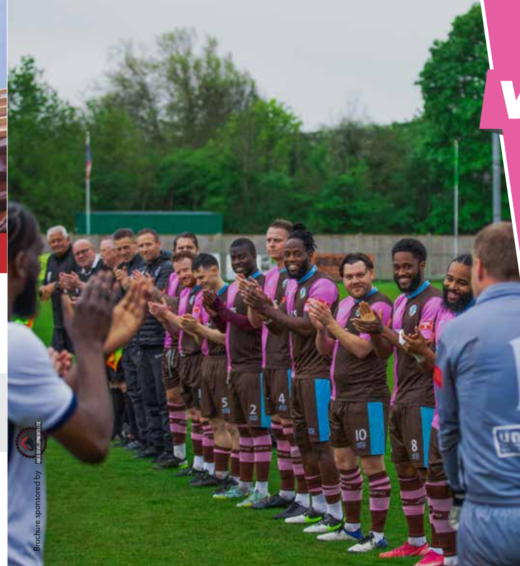
Brochure sponsored by