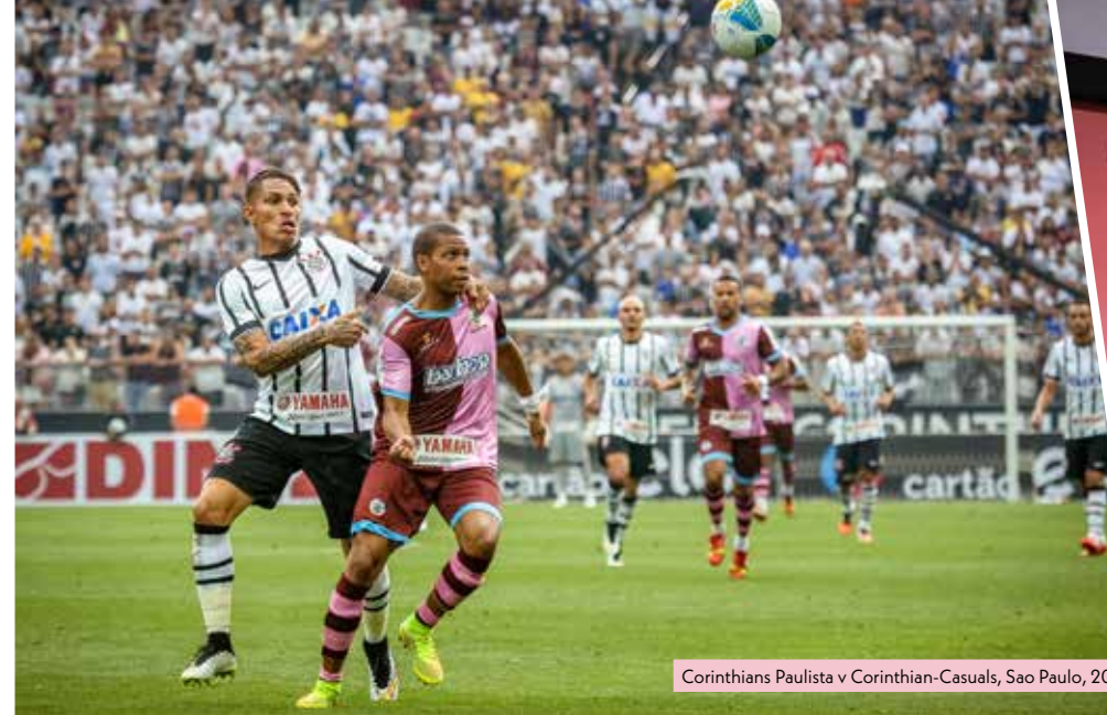
Corinthians Paulista v Corinthian-Casuals, Sao Paulo, 2015