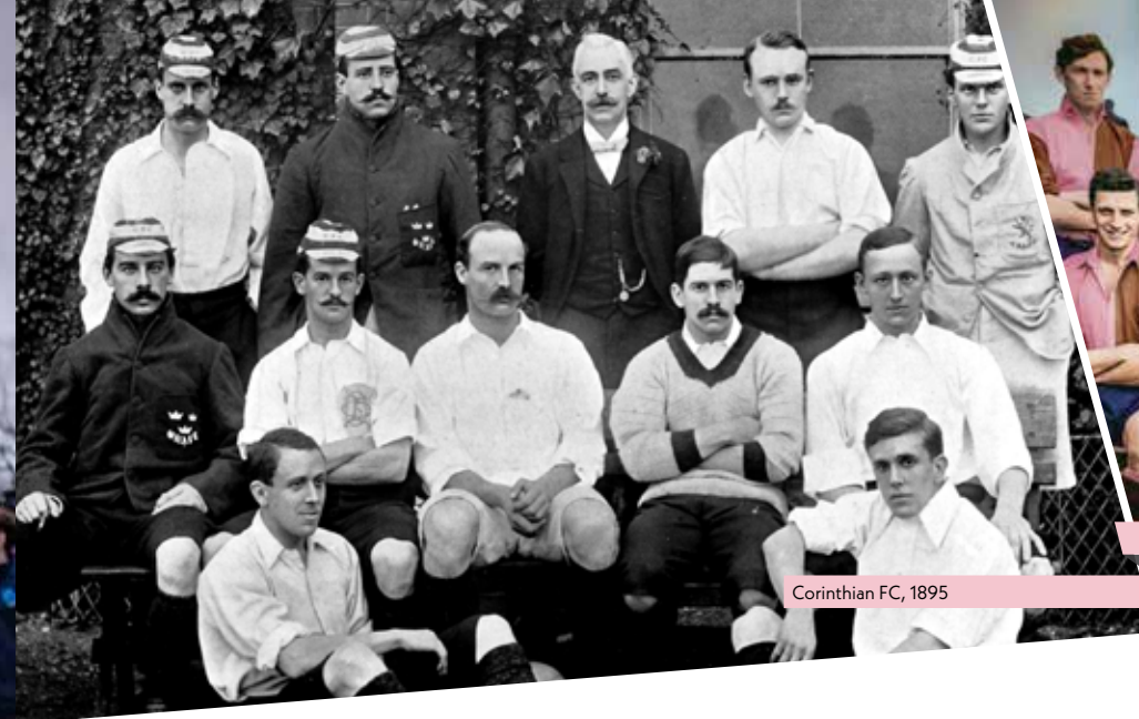
Corinthian FC, 1895