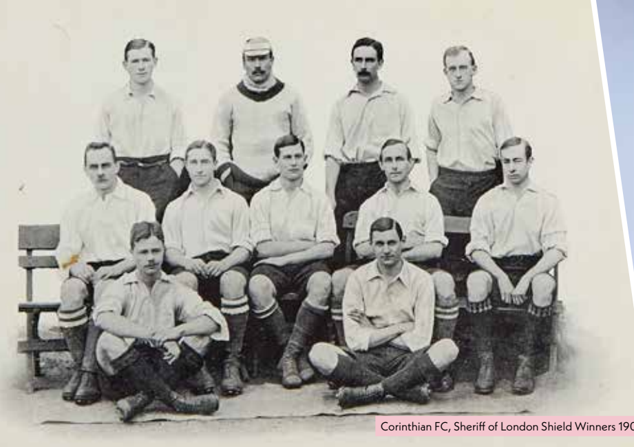
Corinthian FC, Sheriff of London Shield Winners 1904