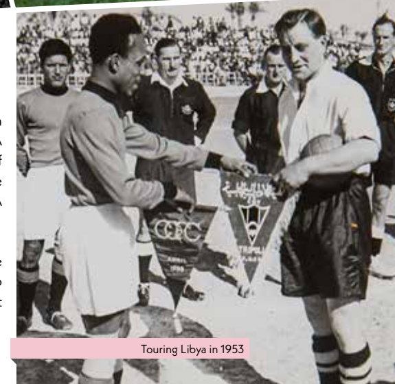
Touring Libya in 1953

The newly merged Corinthian-Casuals entered the league system and reached the FA Amateur Cup final in 1956, with England cricket star Micky Stewart - now the club's president - among their number.