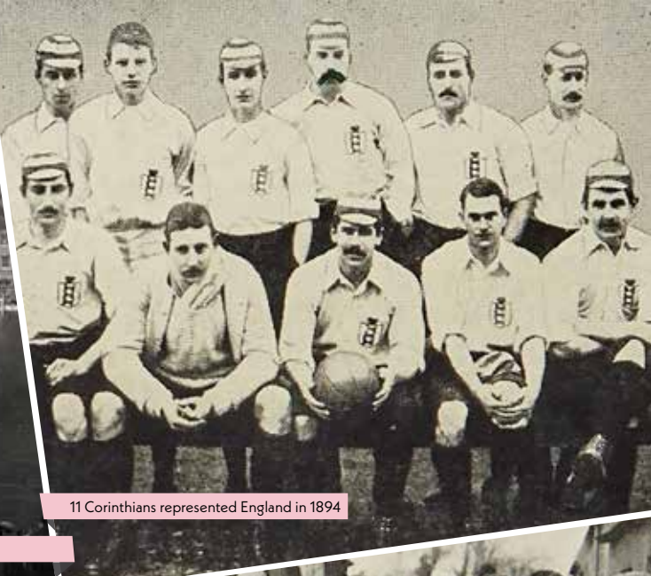
11 Corinthians represented England in 1894