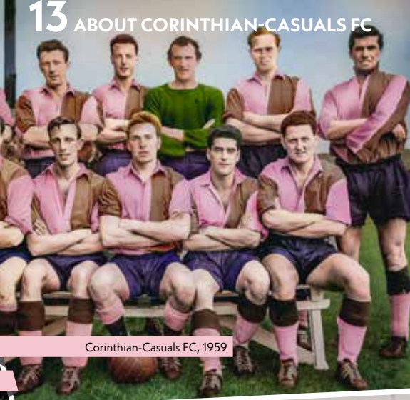
Corinthian-Casuals FC, 1959